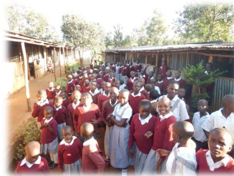
MERCY SCHOOL - 11 corrugated iron classrooms, July 2017