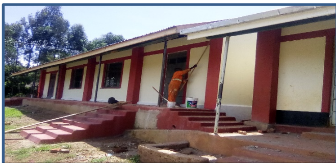
Painting the front phase