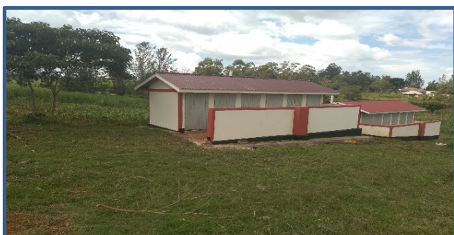
Girls Toilet view