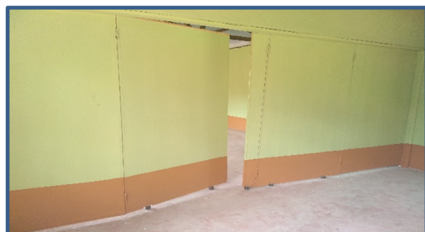
Sliding wall parted