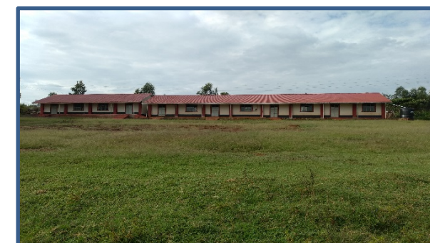
Entire New School Block view