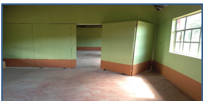
Separating wall reveal adjacent class