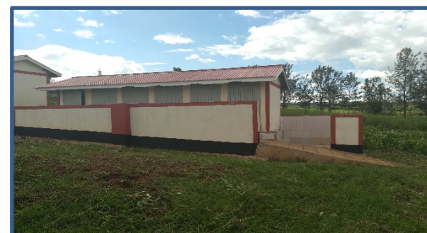
Boys Toilet view